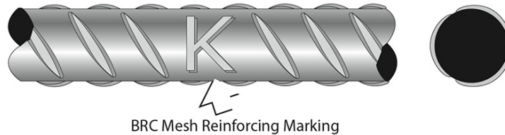
BRC Mesh Reinforcing Marking