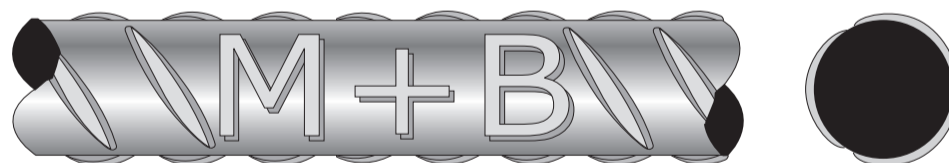
Mesh & Bar